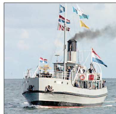
The restored Elfin.

"Elfin became HMS Nettle and continued active service under that name until