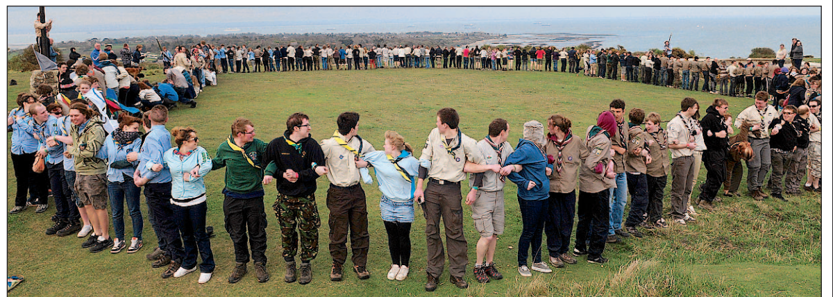
The scouts' Revolution IW record attempt to stand cross legged. 0412-p52169

"The scouts were exhausted when they left but they all made new friends and many have told us they were already looking forward to next year."